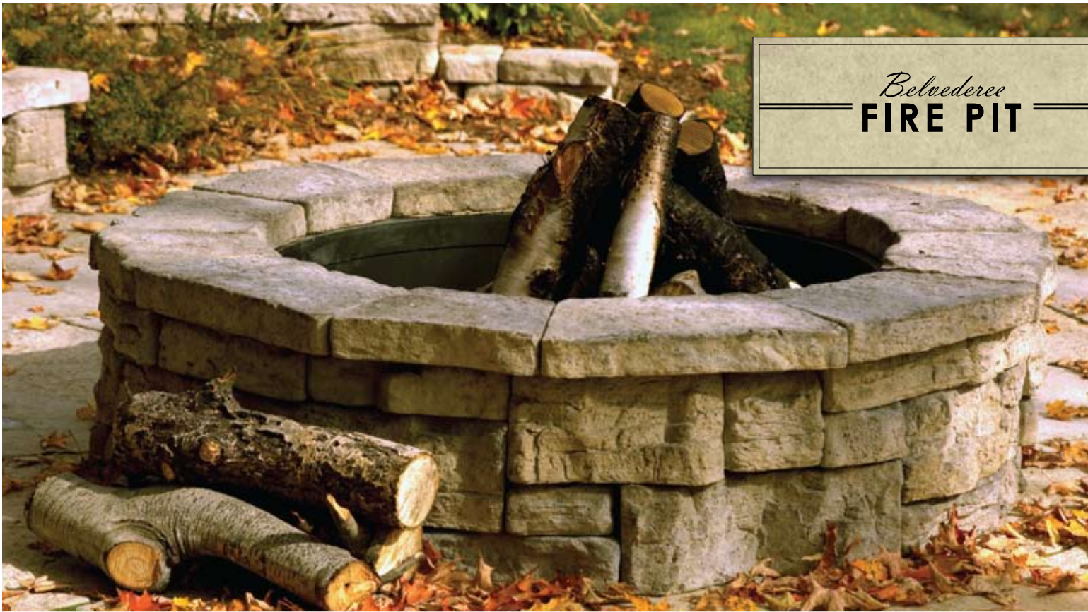
Belvedere FIRE PIT